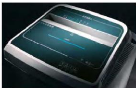
HIGH SHREDDING CAPACITY (UP TO 56 SHEETS AT A TIME)

EPC Electronic Power Control: shows the shredding load required to optimize shredding without jams.